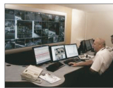
Integration & Control