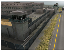
Concept & Design

We offer a range of high-quality, specialised and custom-fit perimeter protection products