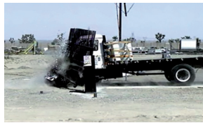
Anti Ram Barriers